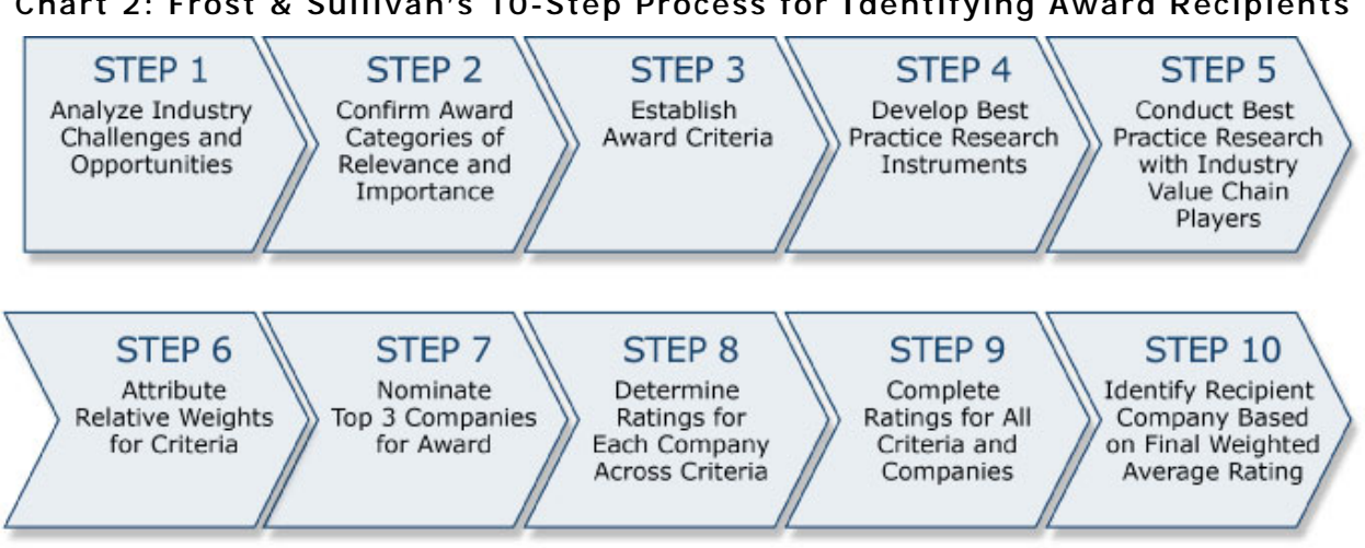
Chart 2: Frost & Sullivan's 10-Step Process for Identifying Award Recipients