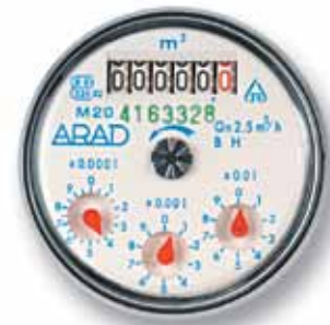
M-WT type dial