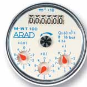
M type dial