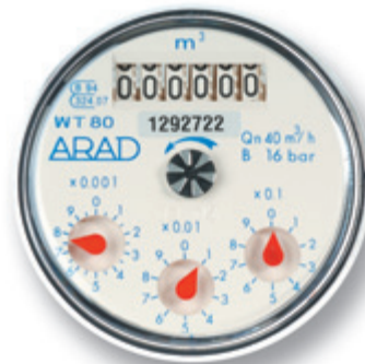
FY type dial