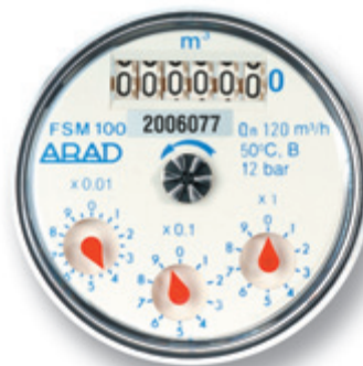
FSM type dial